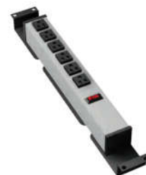
POWER STRIP W5650