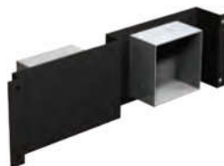
ELECTRICAL BOX WITH BRACKET 56265