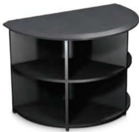
RADIAL END CREDENZA W5630 / W5631