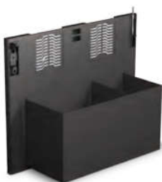
FILE STORAGE BIN (Door Sold Separately) 56088