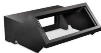
RACK MOUNT TURRET 56030