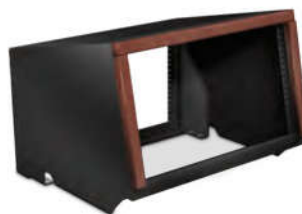
RACK MOUNT TURRET W5661