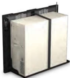
CPU SHELF (Door Sold Separately) 56087