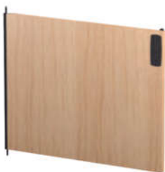
WOOD DOORS 56569