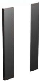
RACK RAILS 56165