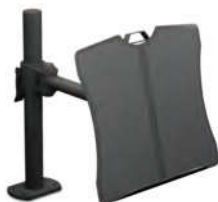
TELEPHONE TRAY W6469